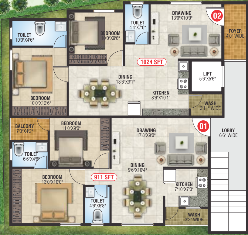
TYPICAL GROUND, FIRST AND SECOND FLOOR PLAN